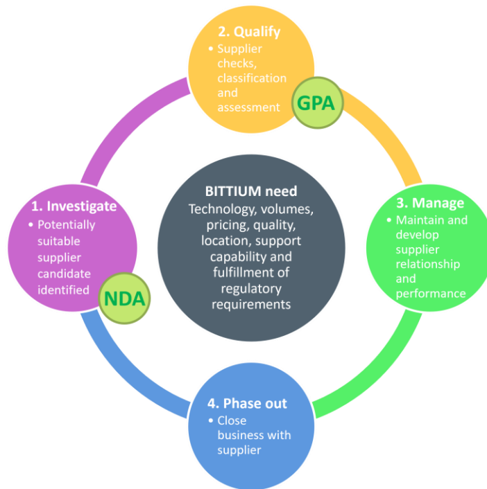
Figure 2 Bittium Supplier Selection, Qualification and Approval

Bittium supplier selection aims to find the most suitable candidates for Bittium businesses in terms of technology, volumes, pricing, quality, location, support capability and fulfillment of regulatory requirements. Not forgetting the compliance with Bittium core policies and supplier quality requirements that ensure compatible ways of working through the supply chain. Bittium supplier selection, qualification and approval process is portrayed in figure 2.